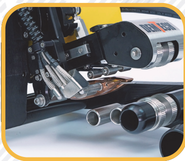
Shown with HDPE welding kit.

In disengaged position, wedge and nip rollers offer plenty of clearance, reducing burn-outs at beginning of seam when welding thin materials.