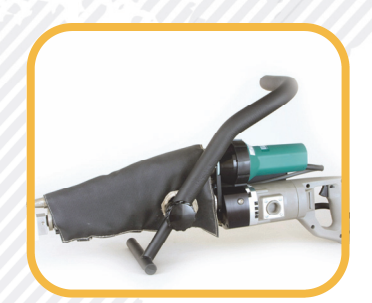
Demtech's custom drive motor design with precision, matched gears for super quiet operation and long reliable life.