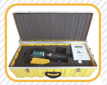
Includes custom shipping/storage case with custom foam insert, sealed for protection against moisture and impact damage.

Many custom models available upon request. Call for details. Specifications on reverse.